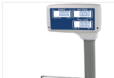
3 x 20 mm LCD display front & back with backlight