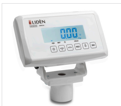
Display with distinct numbers, which makes it easy to read