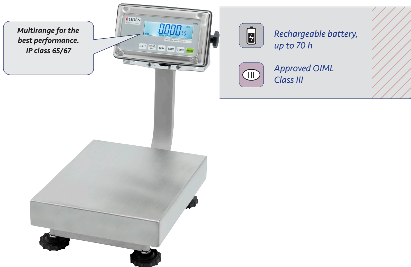
Table scale in stainless steel design, including load cell. Communication RS232 as standard. Approved and available in several capacities 6 – 30 Kg. For wet & tough environments. Built-in rechargeable battery included.